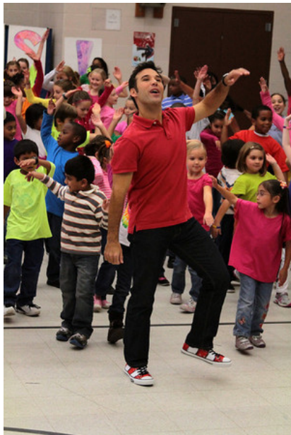
SteveSongs Recess Rocks music video was filmed in Middletown schools.

Recess at most Connecticut elementary schools is 25 minutes long, which may seem lengthy, but when the school day clocks in at six and a half hours, for naturally energetic children ages 4-11, it's not always enough activity.